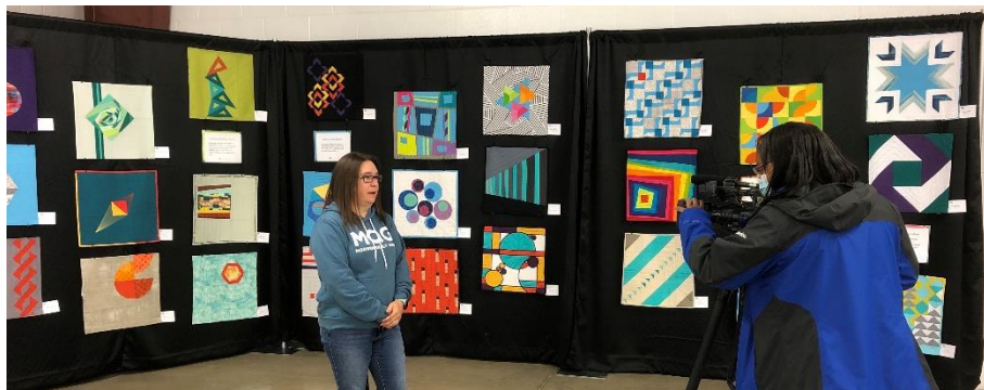
2022 Modern Showcase

Quilts will be collected at the BNMQG April meeting.