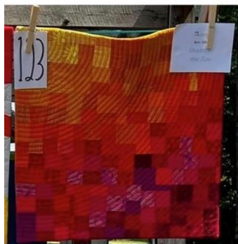
Ann Unes Shades of the Day