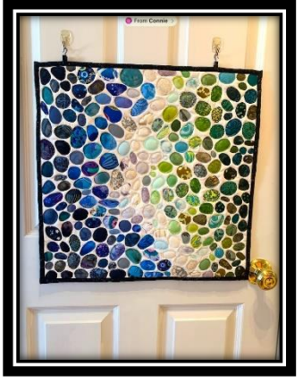
Sea Glass treasure!